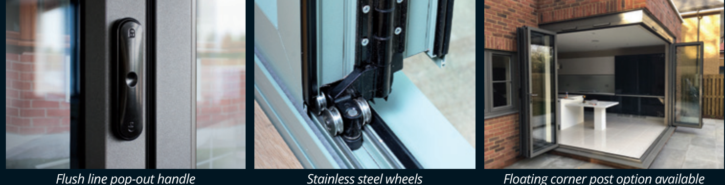
Floating corner post option available