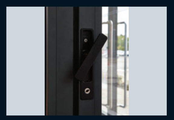
Flush line pop-out handle