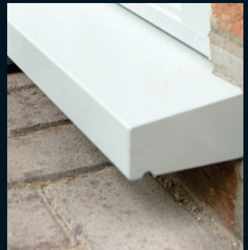
55mm Radlington cill option

Sashes supplied loose glazed, unless sash is greater than 1.5m 2 then factory glazed and bonded