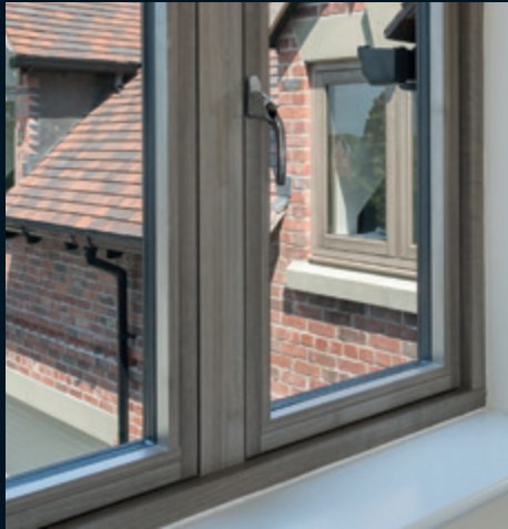
Straight lined innovation, bold looks create a bright living environment