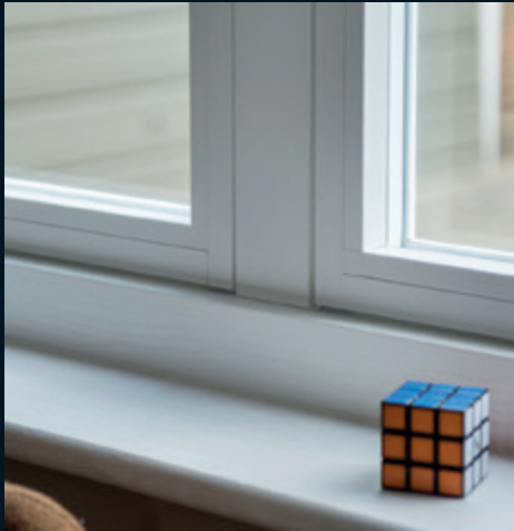
Very clear design with a cutting edge internal shape it is unconventional and unique

Flush2 is the architectural highlight of the Residence Collection, with clean lines and superb performance. With a flush external casement design and a square edge internal finish they are ideal when replacing 100mm traditional timber windows. A choice of styling options make them suitable for period and modern properties.