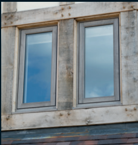
New complementing the old