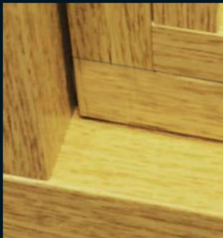
Feels elegant and timeless for those wanting a contemporary look in a traditional building