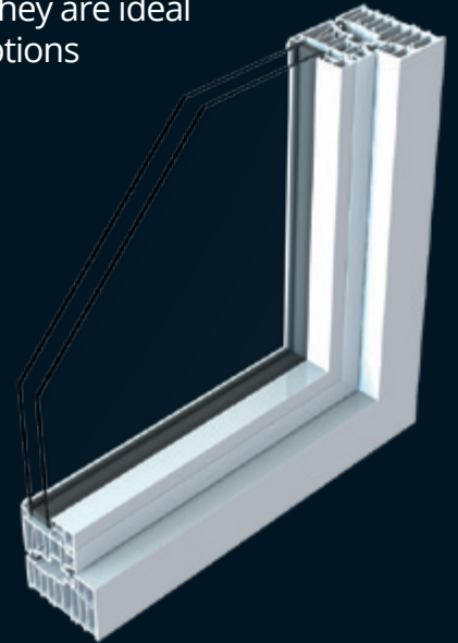
100mm 9 chambered energy efficient profile achieving 0.79 W/m²k U-Value for 28mm double glazing or 44mm triple glazing