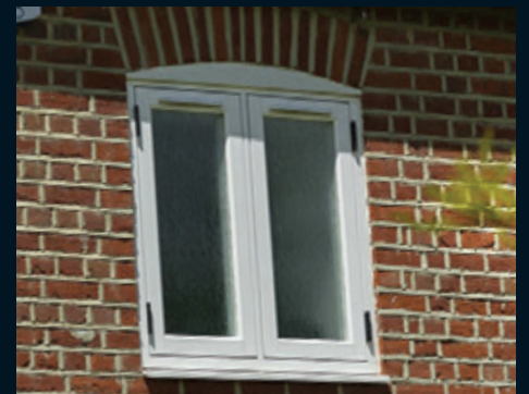
Dummy butt hinge upgrade (Functional butt hinges not available)