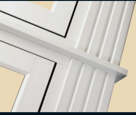
External transom bar upgrade