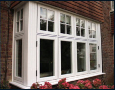
Flush external finishes with equal sightline