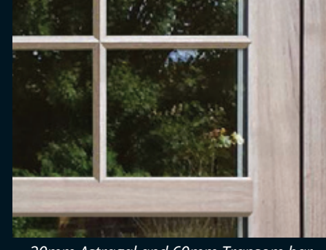
20mm Astragal and 60mm Transom bar upgrade