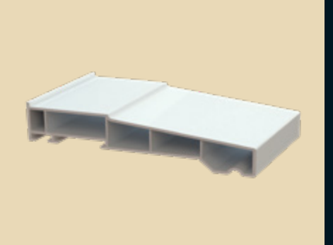
30mm upstand x 165mm Radlington cill Fitted as standard to R7

Sashes supplied loose glazed, unless sash is greater than 1.5m<sup>2</sup> then factory glazed and bonded