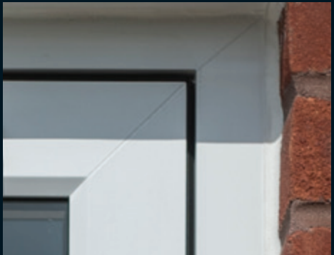
Standard - Corners welded (sash and outerframe) Upgrade - Corners fully mech jointed

'Choices' 'Flush 75' offers the same great external finish as 'Flush 100', but has been designed with a flush finish internally, ideal for replacing modern 70mm systems.