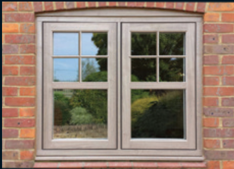
20mm Astragal and 60mm Transom bar upgrade