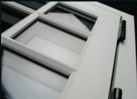
Dummy or functional butt hinges upgrade